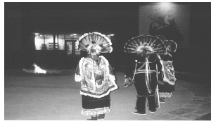
Native American Dancers captivated the audience at the Indian Cultural Pueblo during Dal-Tile "Night on the Town".